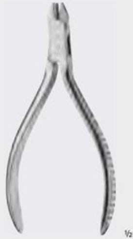
ADERER GD-4430 125 mm, 5" Three-finger pliers 1235394