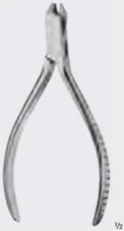
ADERER GD-4429 120 mm, 4 3 / 4 " Three-finger pliers 1235393