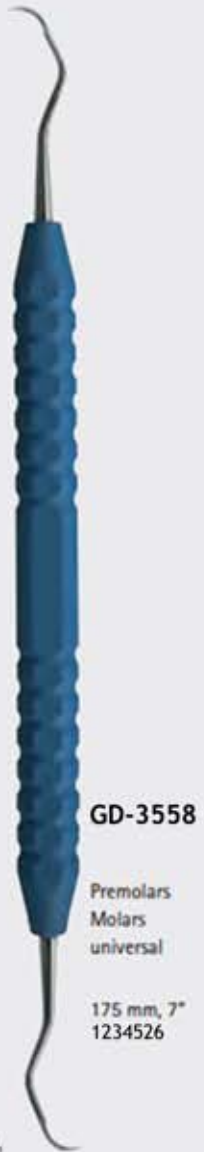
GD-3558 Premolars Molars universal 175 mm, 7" 1234526