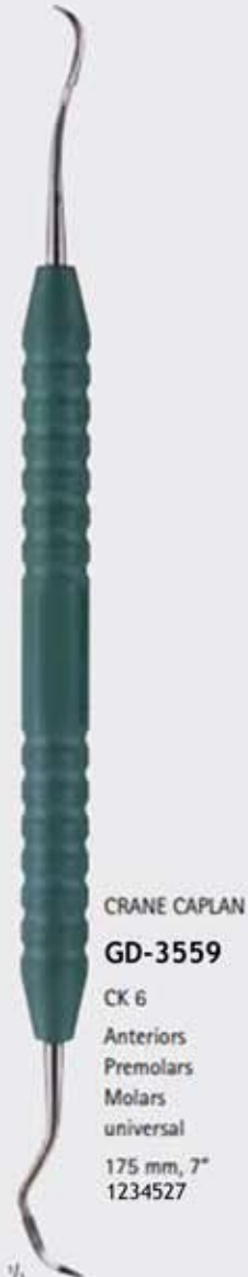
CRANE CAPLAN GD-3559 CK 6 Anteriors Premolars Molars universal 175 mm, 7" 1234527