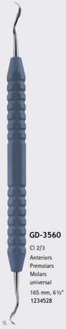
GD-3560 CI 2/3 Anteriors Premolars Molars universal 165 mm, 6 1/2" 1234528