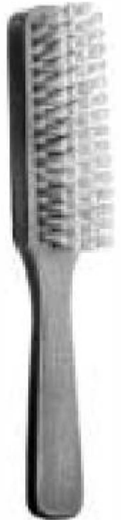
210x95 mm 29027-0