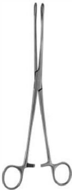
BONNEY 24,0 cm 23014-24