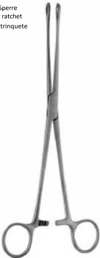
— BERGMANN FOERSTER —