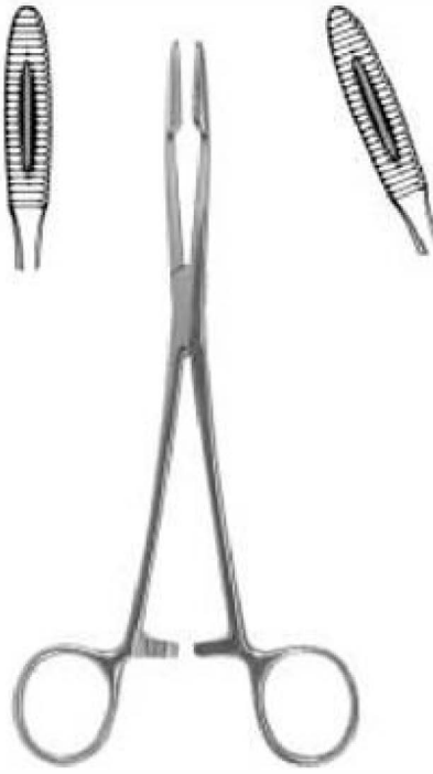
— GROSS-MAIER —

23005-0-14 14,0 cm 23005-1-14 23005-0-18 18,0 cm 23005-1-18 23005-0-20 20,0 cm 23005-1-20 23005-0-22 22,0 cm 23005-1-22 23005-0-25 25,0 cm 23005-1-25 23005-0-27 27,0 cm 23005-1-27 23005-0-36 36,0 cm 23005-1-36 23005-0-40 40,0 cm 23005-1-40