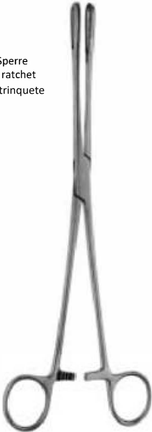
RAMPLEY 18,0 cm 23015-18 25,0 cm 23015-25