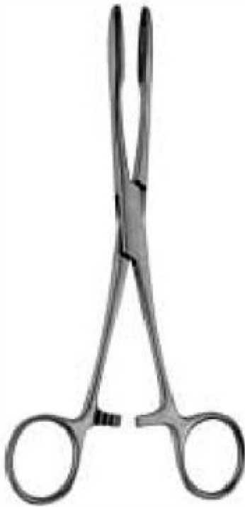
— GROSS — 23007-0-18 18,0 cm 23007-1-18