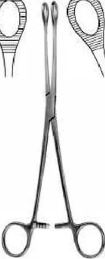
— FOERSTER —