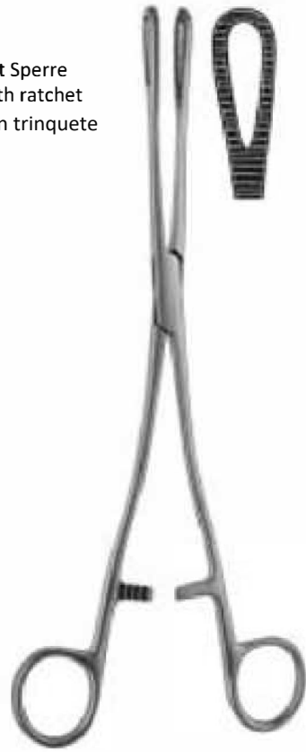
RAMPLEY 25,0 cm 23016-25