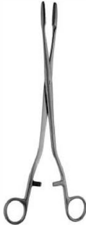
— SIMS-MAIER — 23008-0-28 28,0 cm 23008-1-28