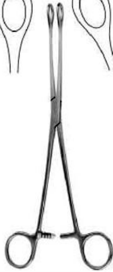
— FOERSTER —