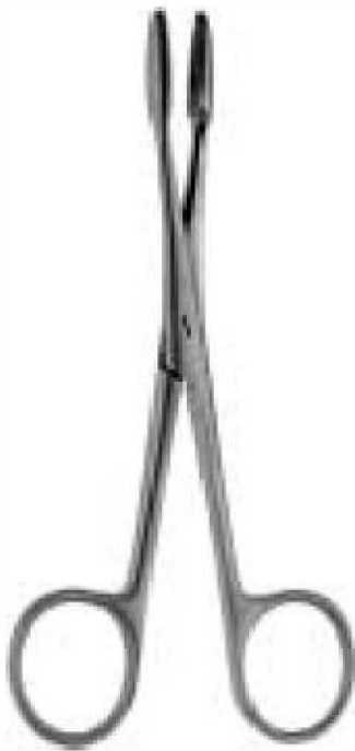
— GROSS-MAIER —

ohne Sperre without ratchet sin trinquete